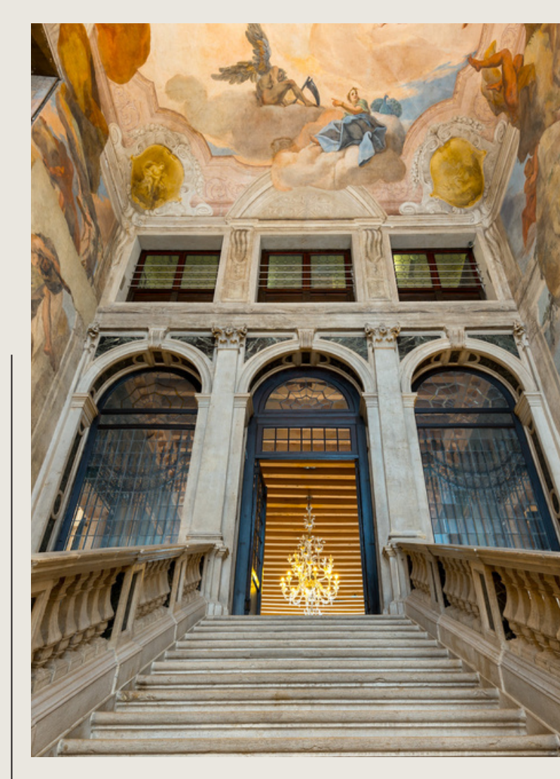
the magnificent staircase of Ca Sagredo

Ca' Sagredo Hotel, a historic Venetian palace, provides the perfect setting for a Gilded Romance styled shoot, exuding unmatched luxury and refinement. Its gilded interiors, awe-inspiring frescoes, and timeless architecture exemplify elegance at its peak.